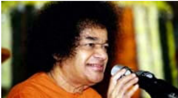
Sathya Sai Baba

"Love All Serve All" - "Help Ever Hurt Never"