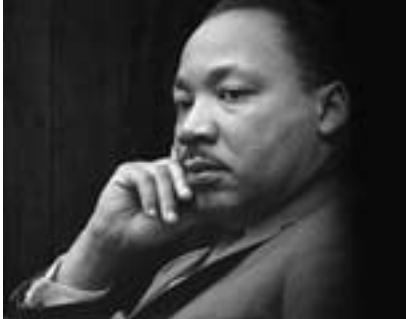
Martin Luther King

"It is not possible to be in favor of justice for some people and not be in favor for of justice for all people. "