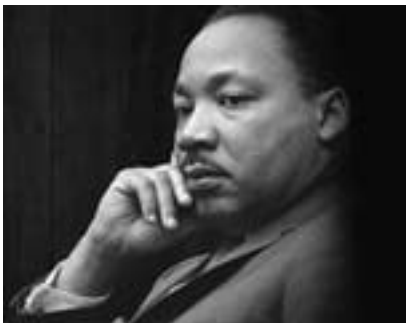
Martin Luther King

"Freedom is never voluntarily given by the oppressor; it must be demanded by the Oppressed. "